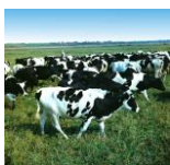
КОРОВЫ ПАСУТСЯ НА ЛУГУ